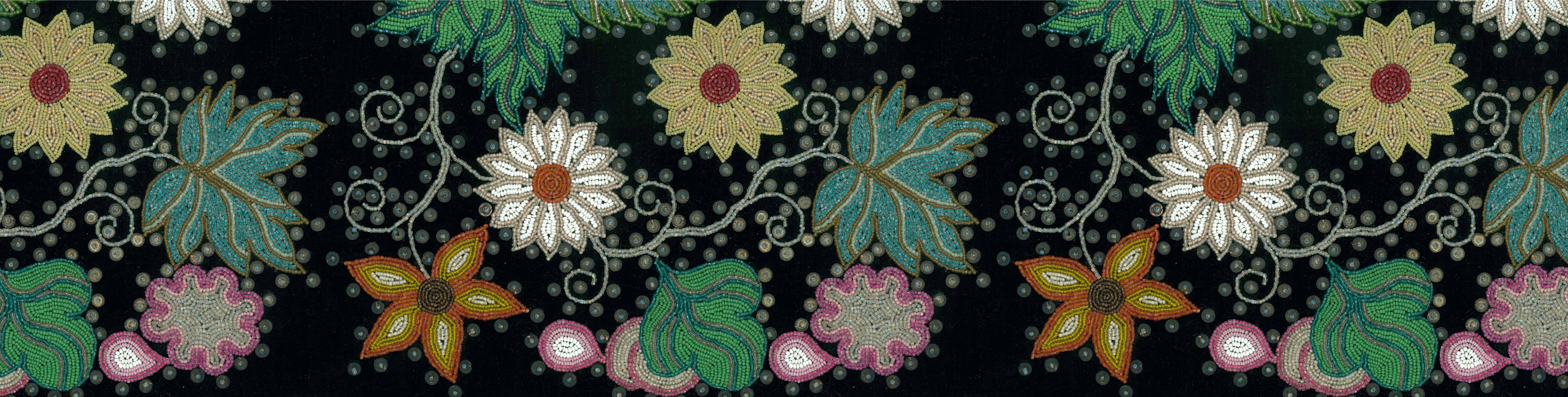
Floral designs created by Ojibwe artists represent the flowers and plants found close to their woodland homes.