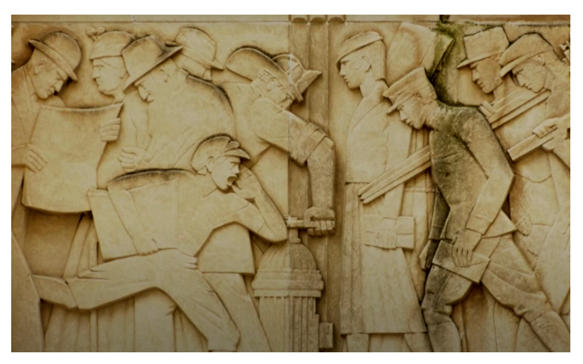
DOCUMENTARY STILL FROM: Farmer Labor Education Committee, The Farmer-Labor Movement: A Minnesota Story (2022)