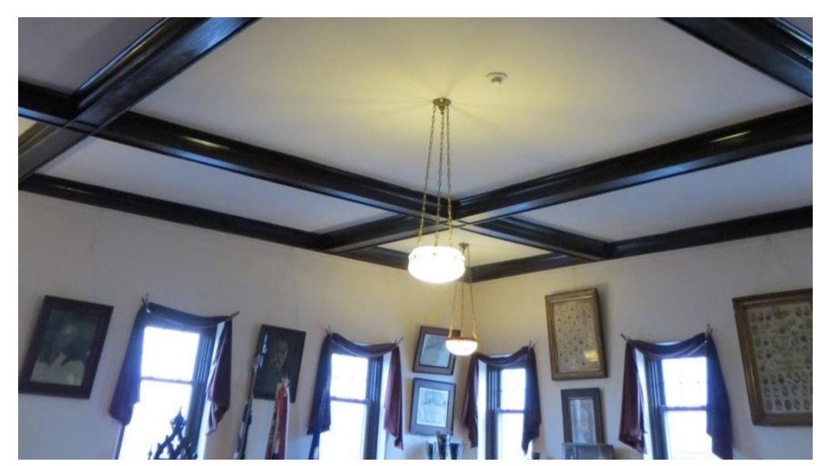
LABELED PHOTO EXAMPLE: PHOTO 0001: Existing ceiling plaster w/wood box beams