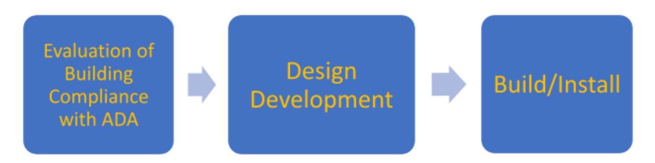
Potential phases for an ADA project (some omissions for space)

ADA projects should start with an overall evaluation of compliance with ADA, in order to prioritize work effectively. ADA assessments are often included in National Register listed building Conditions Assessments. Some simple ADA projects can apply for a design/build project. This means the project is small enough that the evaluating consultant has suggested that both the design of upgrades and the installation can happen in the same grant project. However, most projects will need to complete their designs before applying to install the ADA upgrades.